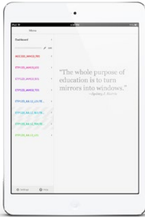
Blackboard Mobile Learn